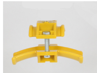
FTSW-EDRS/FTSW-EDRL: End Clamp to use with large or small round cable