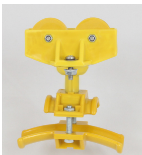
FTSW-TCRS/FTSW-TCRL: Intermediate Car to use with large or small round cable