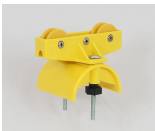
FTSW-TCFL: Intermediate Car to use with flat cable

Add to an existing Stretch Wire Festoon system with K&H's Cable Cars and End Caps. Easy to install with no special tools