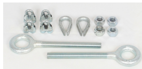
FTSW-HW-KIT: Festoon Hardware Kit